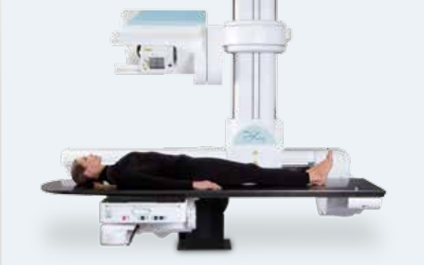
TRANSVERSAL OBLIQUE PROJECTIONS