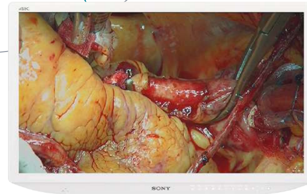
SONY Medical Monitors